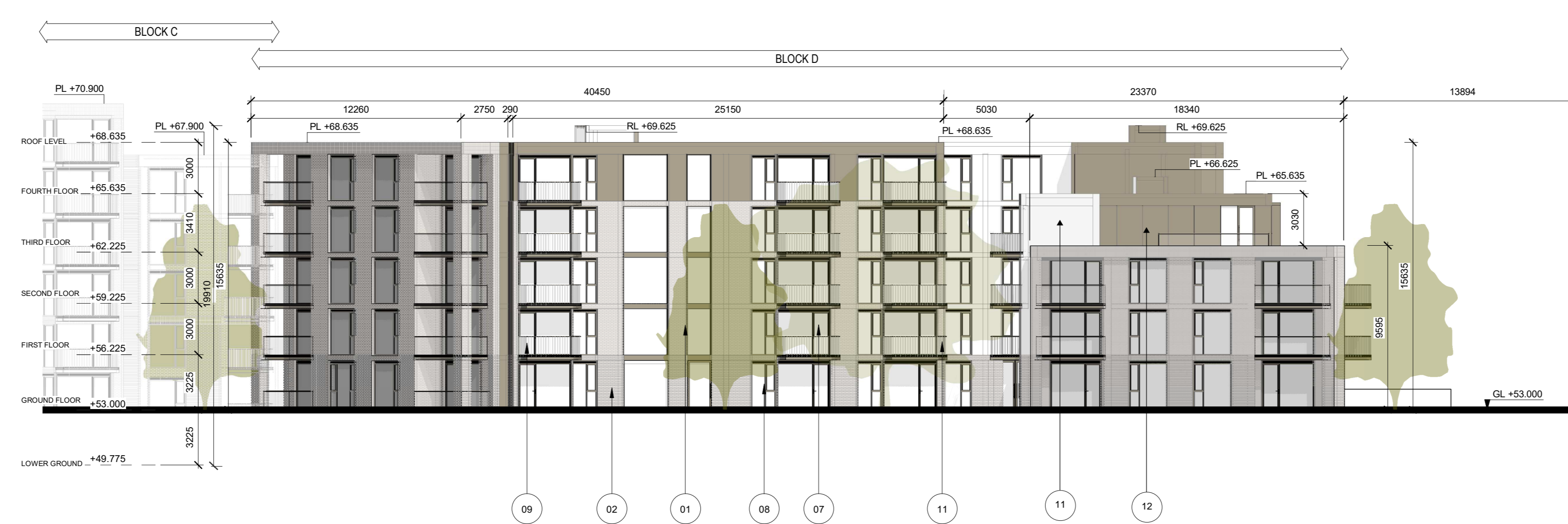
1 BUILDING D - ELEVATION - WEST 1:200