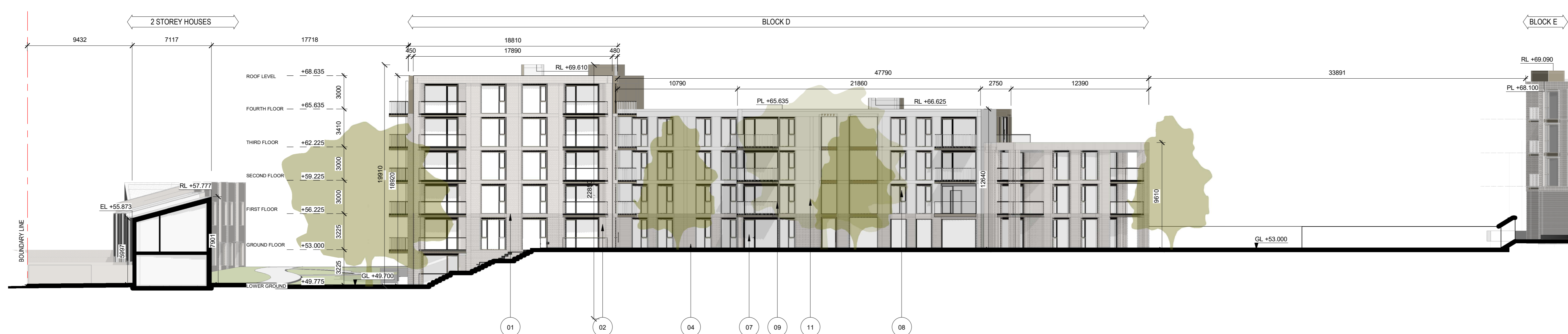
3 BUILDING D - ELEVATION - NORTH 1:200