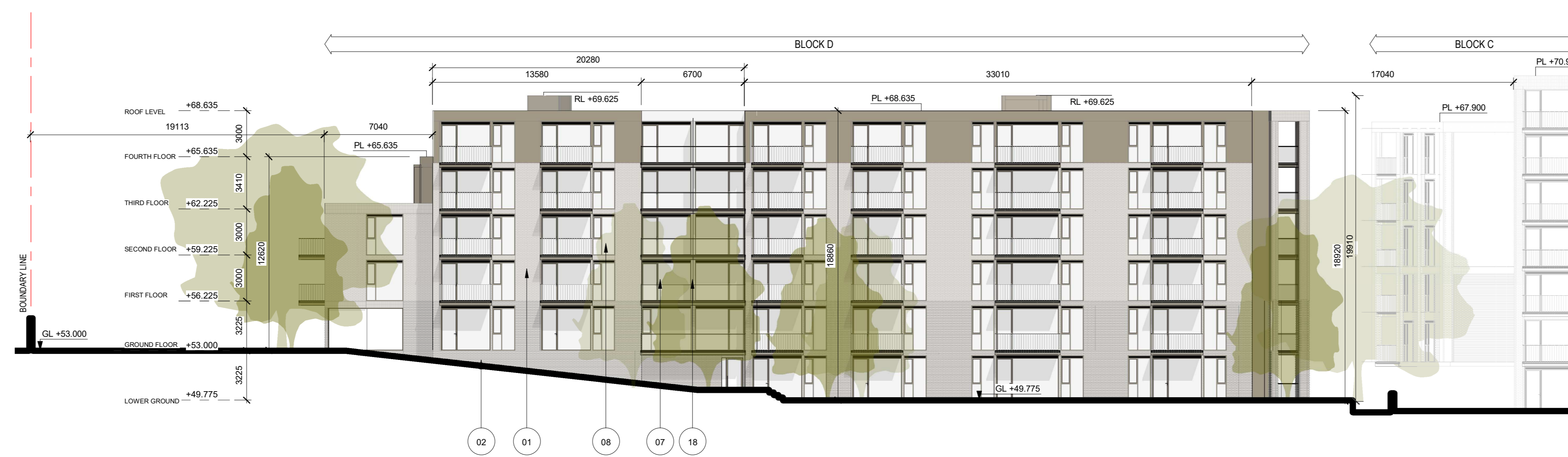
4 BUILDING D - ELEVATION - EAST 1:200